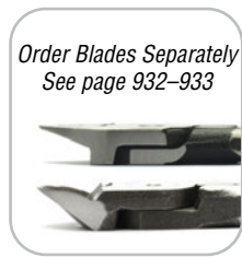
NY10 - Sliding Nipper